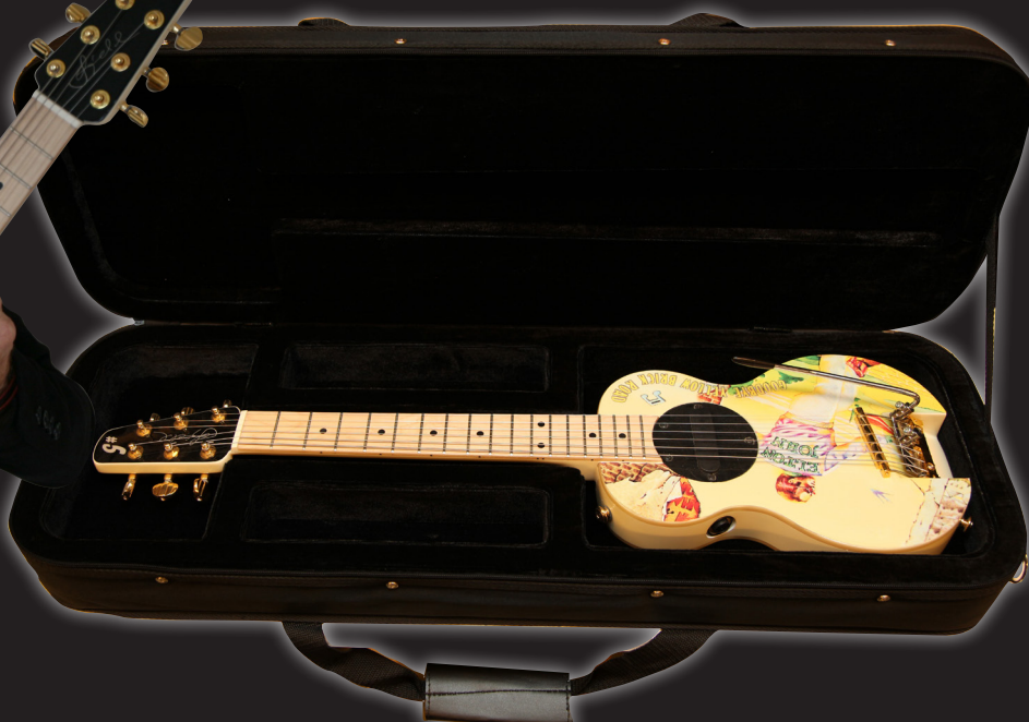
The G# Hardcase (seen here with Elton John's "Yellow Brick Road" guitar). Measures 81cm (L) x 28cm (W) x 12cm (H).