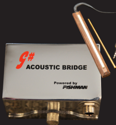
The Acoustic Bridge