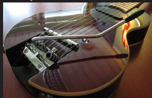
The Double Action Vibrato System